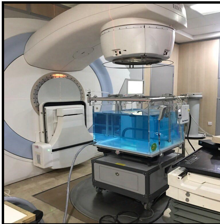
Fig.1: Phantom was filled with distilled water.

levelling frame with a cross mark on it was moved on the water surface so that the midpoint of the cross mark adjusted to coincides with the water surface. The ionization chamber was fixed into the water phantom such that the sensitive part coincides with the water surface for our first measurement (that is; at 100 cm SSD) the ionization chamber can be moved through the water phantom along the central axis. A scan length of 1 cm and all necessary parameters for the field including the field size were entered in the basic setting. This setting permits the dose to be recorded after every 1cm increase in depth of travel of the ionization chamber along the central axis.